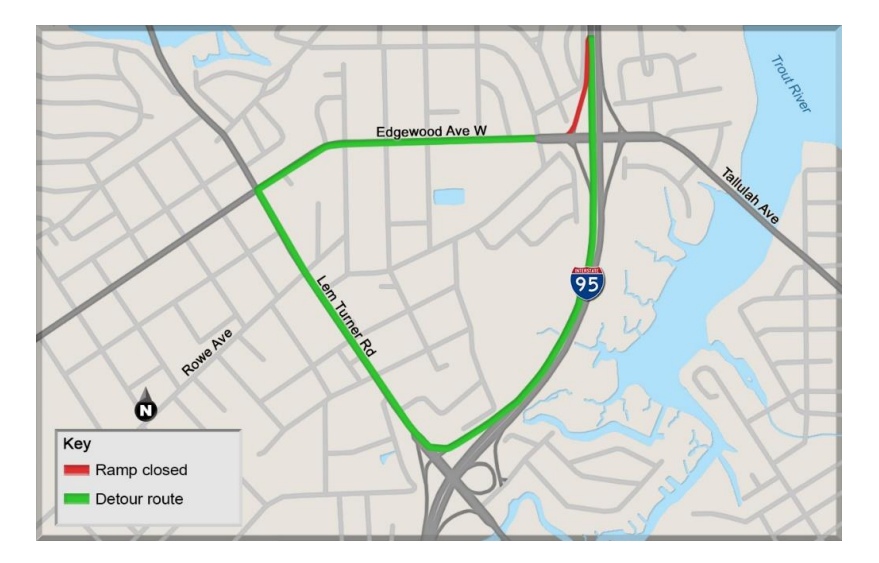
Detour C: May 7 from 7:30 p.m. to 6:30 a.m. Motorists who wish to access I-95 north from Edgewood Avenue will take I-95 south to the Lem Turner Road exit, take a left on Lem Turner Road, take a left on Carrollton Road, then take a left at the I-95 north on-ramp. (See map below)